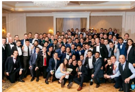
Delta Omicron Sig's celebrate at the Sutton Place Hotel at their recent sweetheart ball.