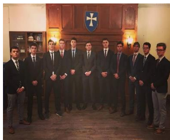
McGill's Gamma Lambda fall pledge class.

With that comes the responsibility of the Foundation in ensuring that our agenda is clear; to strengthen Sigma Chi in Canada, and act as a vehicle for the local Active Chapters, Alumni Chapters and/or House Corporations, and to raise tax-deductible funds for educational purposes.